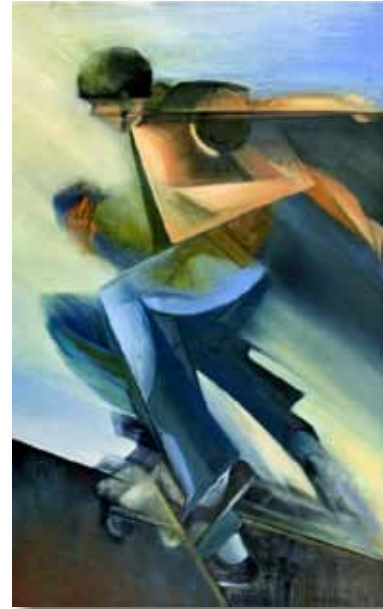
C2 Off the Wall