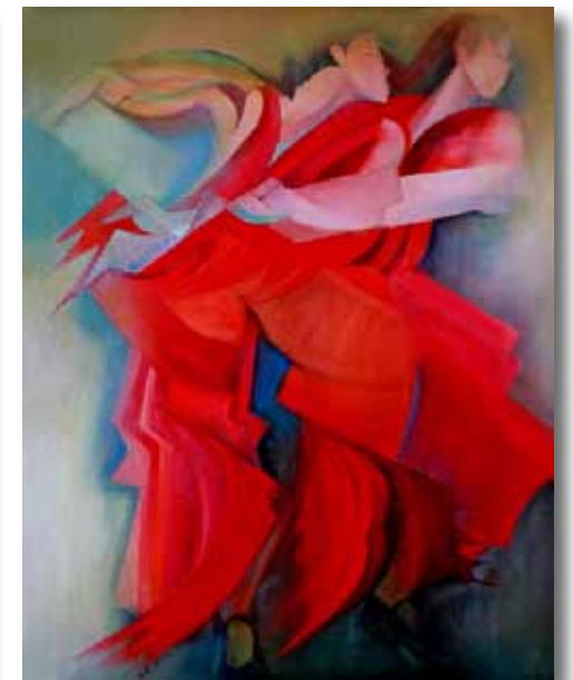
C17 Red Dancers