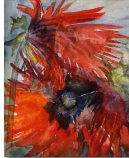
C19 Red Petals