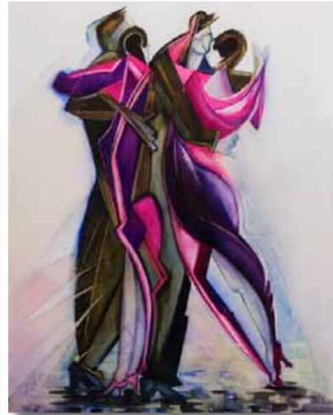
C14 Double Tango