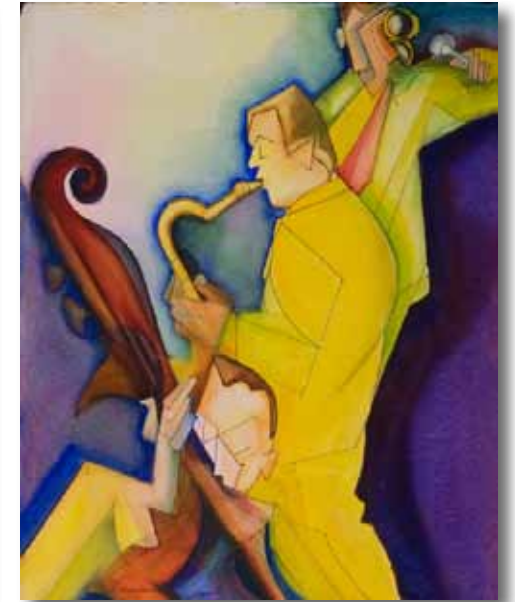
C15 Jive Aces