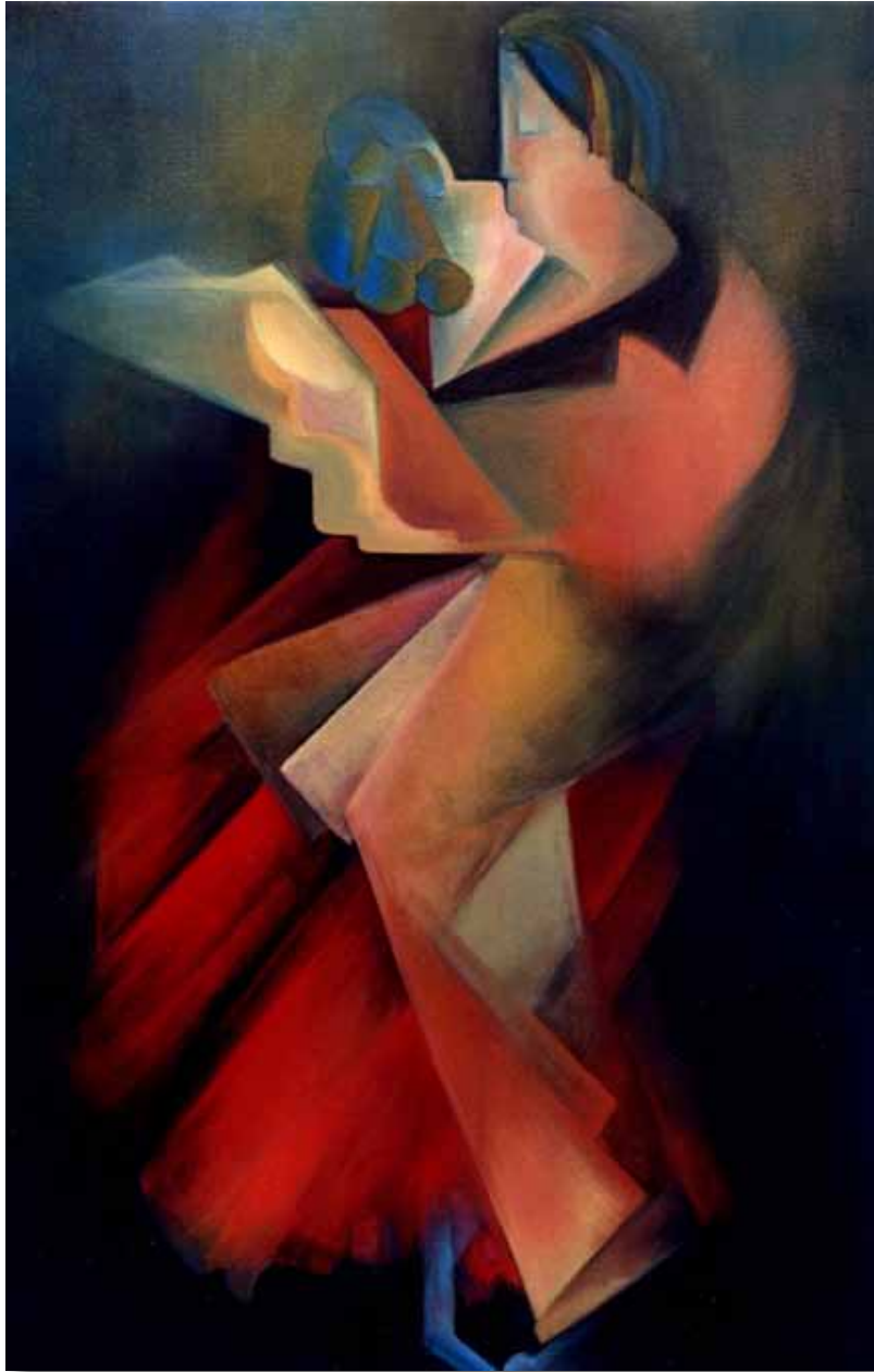
C1 The Dancers

Available in two sizes: 21cm x 30 cm (A4) OR 40cm x 50cm