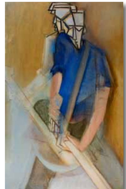
C5 Guitar Player