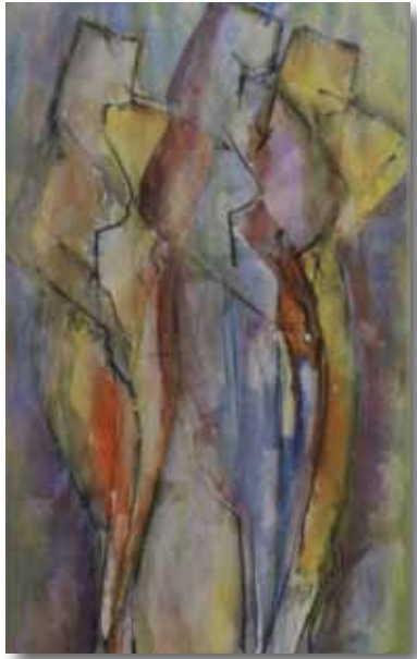
C6 Three Figures

Available in two sizes: 21cm x 30 cm (A4) OR 40cm x 50cm