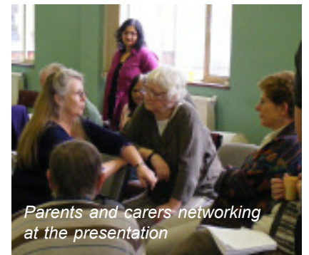
Parents and carers networking at the presentation